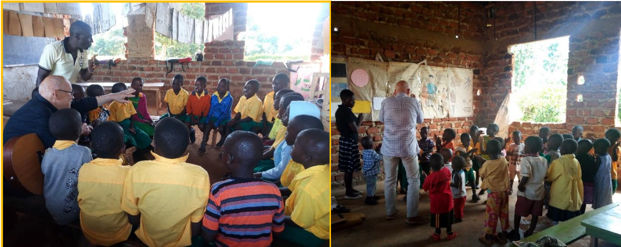
Here the SE is facilitating a musical morning circle in the P2 class(Left) and Baby Class(Right)

Now the SE embarked on delivering practical classroom sessions in the different classes as a way of mentoring the local staff on better teaching approaches and methodologies. He emphasized the notion of the morning circle where teachers should kickstart the day with a simple musical moment or a story telling as an ice-breaker to prepare the minds of the learners for the normal lessons. As a skilled guitarist, he always used his guitar play very interesting melodies for the learners and this proved to be so nice to them. They enjoyed songs like: Salibonani, hello good morning, Amen Si ya kudumisa, A ram sam sam, Wasuzoty-a-good morning-buenos sias-carimera.....among others.