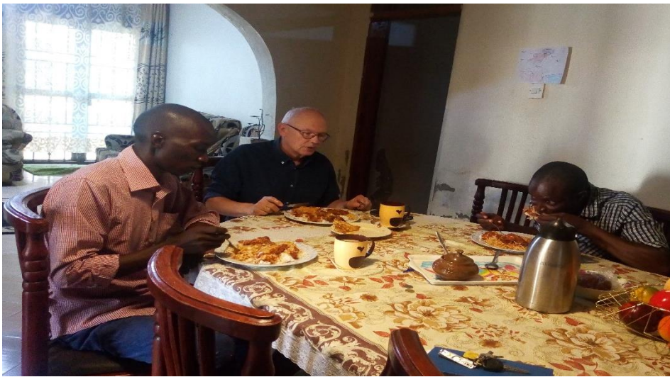
Here the SE is having his final/farewell meal with the SHAK school directors slightly before setting off for Entebbe Airport for his flight back to Germany