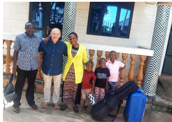
The SE posing with the directors as a farewell gesture slightly before boarding the school van to start his journey to back Germany