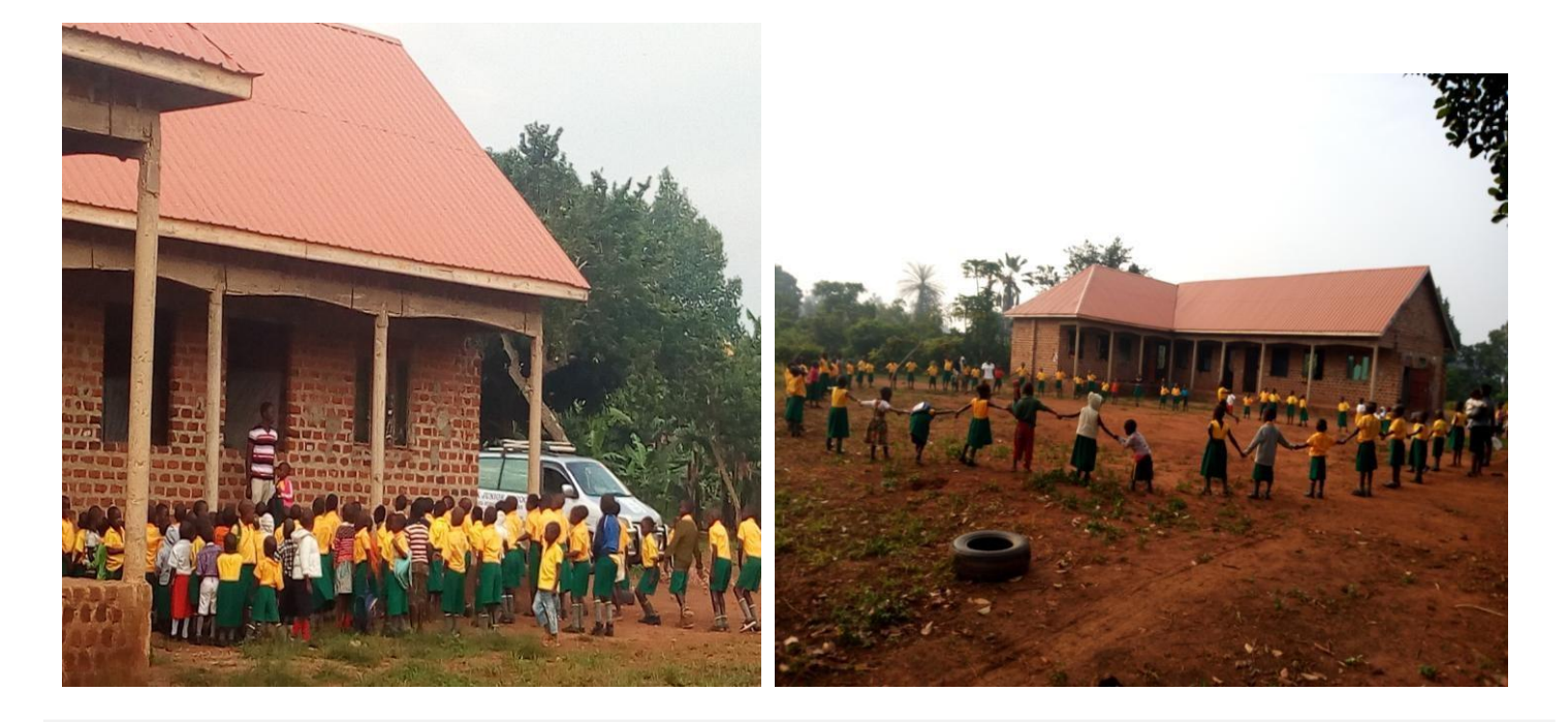
Left: Children during one of the morning assemblies; Right, Nursery learners doing their morning physical exercise(the morning circle)