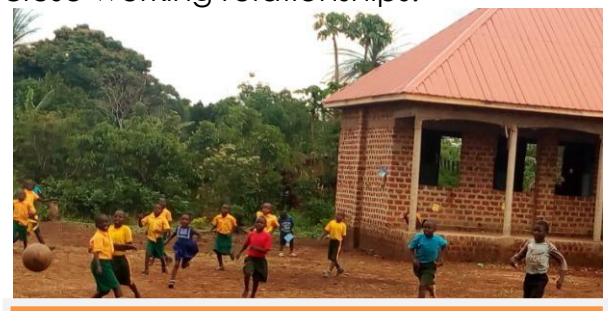
Healthy bodies for healthy minds: Learners playing football during break time