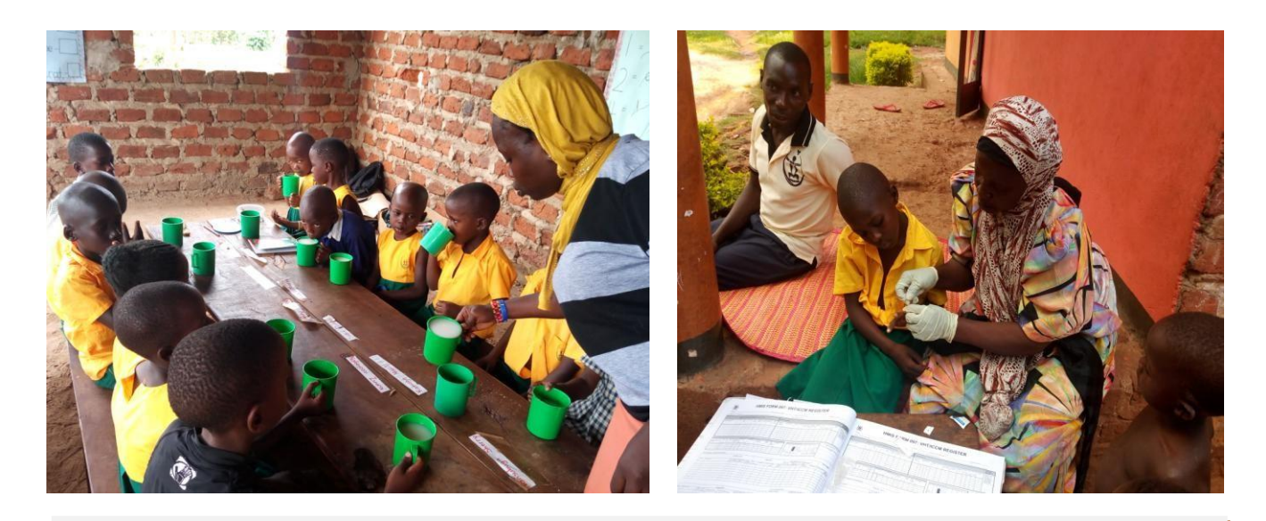
Left: Some of the Top class learners having their breakfast meal; Right One of the learners taking a malaria test at one of the Village Health workers accompanied by one of our teachers

Healthy bodies for healthy minds: Children taking one of the lunch meals at school