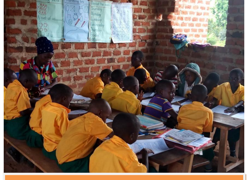
P.1 Learners during one of their classroom sessions

We strive to eliminate barriers to enjoying the right