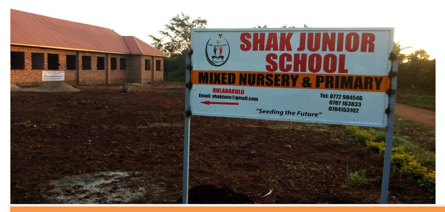
A close range front view of the school campus from the main road