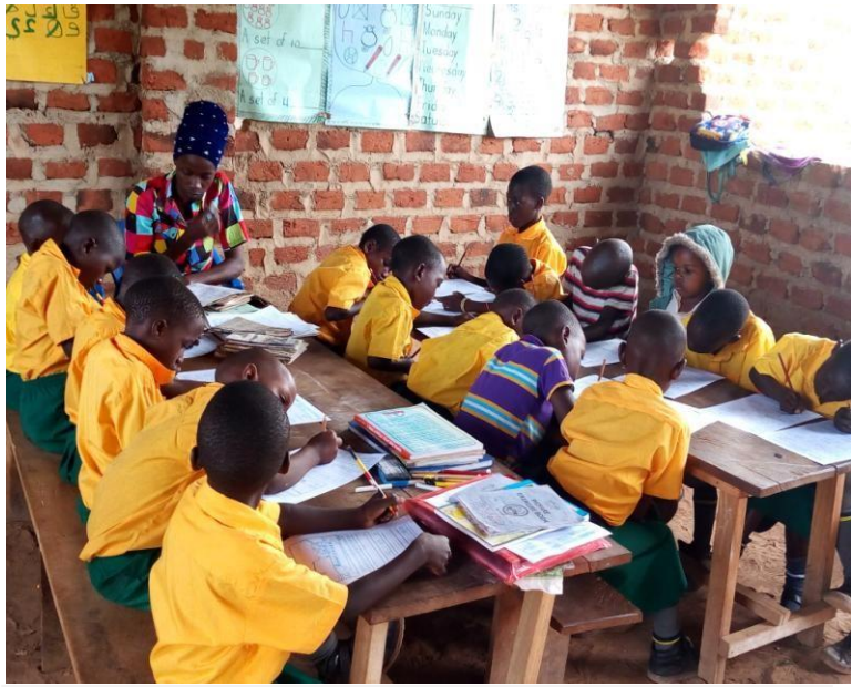
One of our caregivers taking time with P.1 learners during one of their class sessions