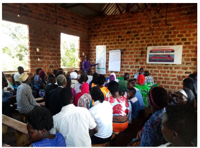
The School director addressing caregivers during a stakeholder consultative meeting at School

as a Center of academic excellence as well as moral and social nurture for the children at our service.