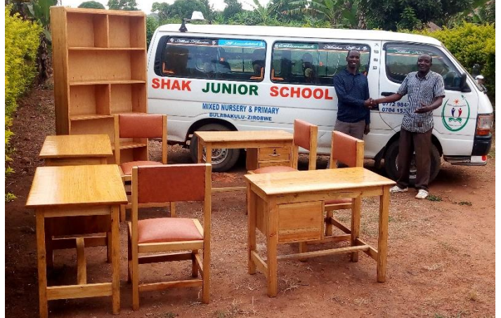
Picture of some teachers' desks and chairs donated by our German friends