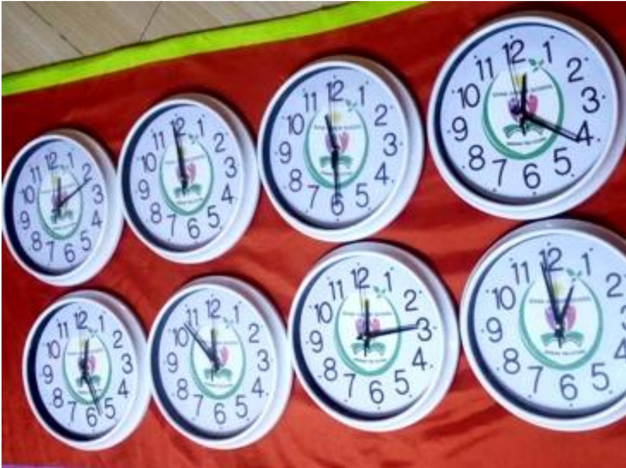
Picture of wall clocks donated by our German friends

8 Quality Wall clocks purchased to enhance time management and observance of scheduled classroom activities for better learning outcomes