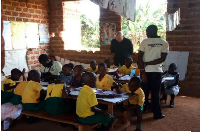
Pics showing teachers in classrooms without worktops

7 teachers' desks with fitting chairs purchased. Now teachers can comfortably have adequate sitting and worktop station as well as lockable drawers for keeping some essential/sensitive classroom materials