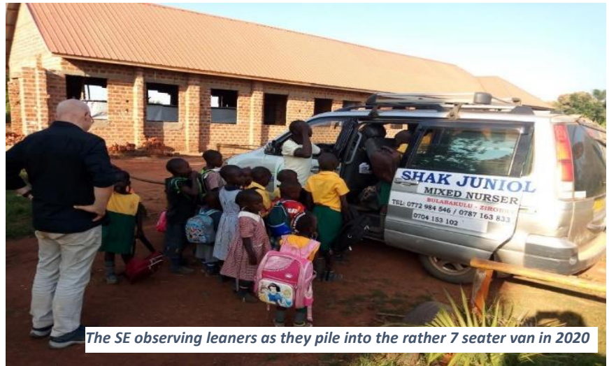
The SE observing learners as they pile into the rather 7 seater van in 2020

Initially the school had only one 7- seater Noah car that was used to carry over 65 learners to and from their homes school. This meant that the learners had to be picked in shifts and given the poor