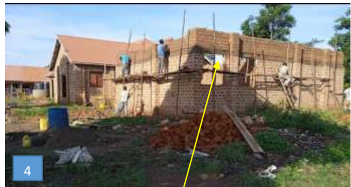
Pic 4: Level where First round ended (It Majorly covered outer walls)